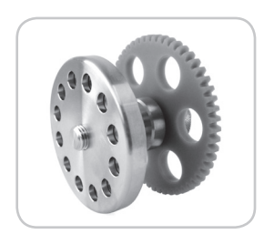
0.5/0.65 ml tube holder (Cat. No. UCD-pack 0.5)

For DNA shearing we highly recommend to use the tube holder for 0.5/0.65 ml tubes (Cat. No. UCD-pack 0.5) and the corresponding Bioruptor® 0.5 ml Microtubes for DNA Shearing (Cat. No. WA-004-0500).