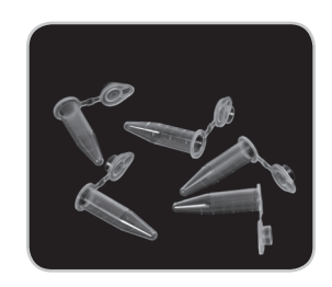
Bioruptor® 0.5 ml Microtubes for DNA Shearing (Cat. No. WA-004-0500)

To use the tube holder, remove the lower part by turning counterclockwise. Then place microtubes into the unit. Attach the lower part to the upper part of the adaptor. To guarantee homogeneity of DNA shearing, the tube holders should always be completely filled with tubes. Never leave empty spaces in the tube holder. Fill the empty spaces with tubes containing the same volume of distilled water.