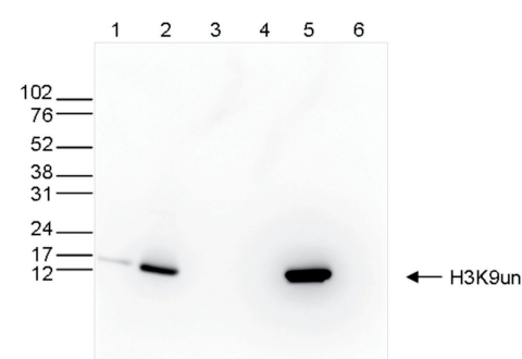
Figure 2. Western blot analysis using the Diagenode monoclonal antibody directed against H3K9un

ChIP assays were performed using human HeLa cells, the Diagenode monclonal antibody against H3K9un (Cat. No. MAb-187-050) and optimized PCR primer sets for gPCR. ChIP was performed with the "Auto Histone ChIP-seg" kit (Cat. No. AB-Auto02-A100) on sheared chromatin from 1 million cells. using the SX-8G IP-Star automated system. A titration of the antibody consisting of 1, 2, 5, and 10 µg per ChIP experiment was analysed. IgG (2 \mu g/IP) was used as negative IP control. QPCR was performed with primers for the coding regions of the MYOD1 and MB genes and for a region 1 kb upstream of the GAPDH promoter, used as positive controls, and for the ZNF510 coding region, the EIF4A2 promoter and the Sat2 satellite repeat region, used as negative controls. Figure 1 shows the recovery, expressed as a % of input (the relative amount of immunoprecipitated DNA compared to input DNA after qPCR analysis).